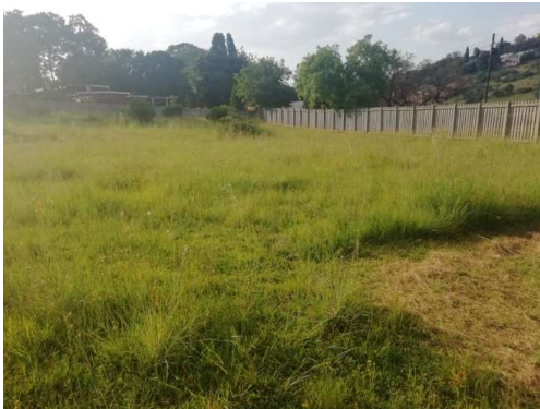
Thank you Phillip Mkhombo for allowing veld grasses to flourish near the entrance

FroK has asked JCPZ for expert advice for years because the lawn keeps deteriorating due in large part to overcutting by brush cutters Weeds have widely taken over from grass