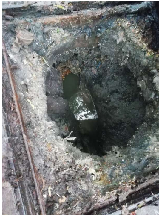
The hidden problem