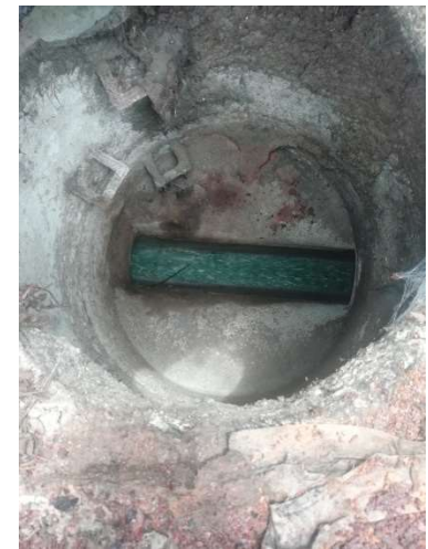
This one looks OK