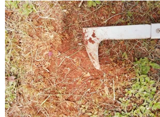
Example of overcutting