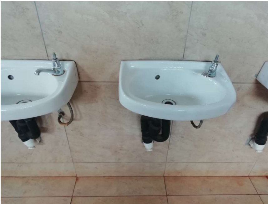
Repair or replace disabled taps