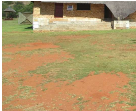
High use area