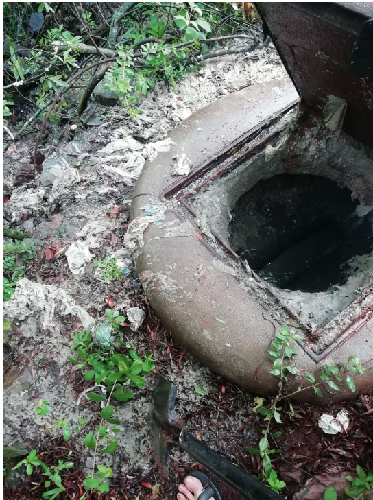
The visible problem