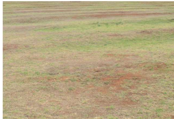
Medium use area

Why has JCPZ lawn management been so bad?