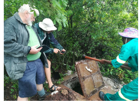
Lifting a man-hole cover