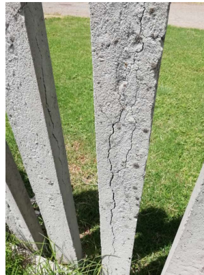
Poor quality, sections should be replaced

The security guards need an all-weather shelter in the parking area.