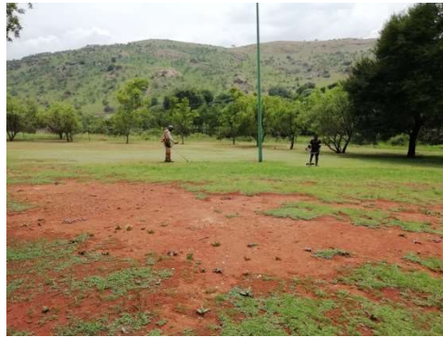
No-use area being cut below parking area