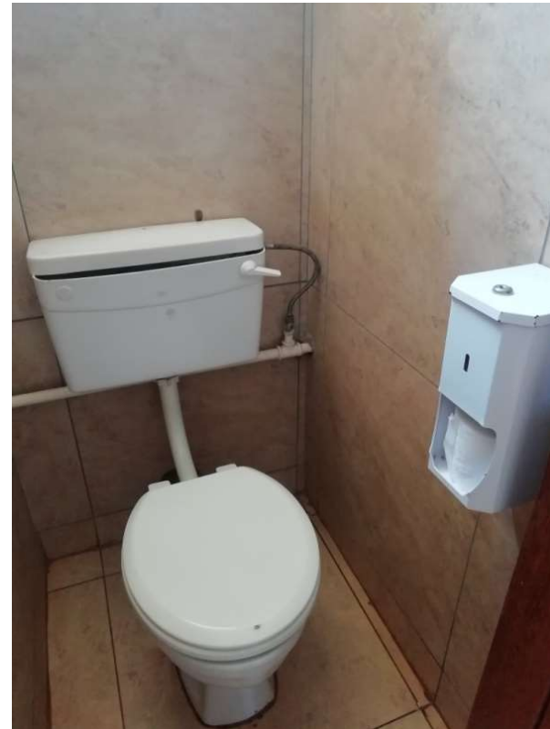
Install Single-flush cisterns?

Thank you JCPZ for clean toilets and for supplying toilet paper.