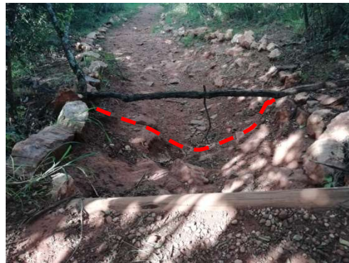
Erosion & gully formation