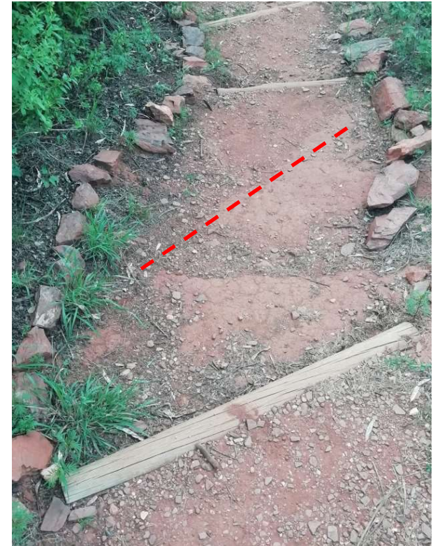
More logs and better drainage needed

Two rescue cases in the last year Paths are dangerously loose and inadequately drained.