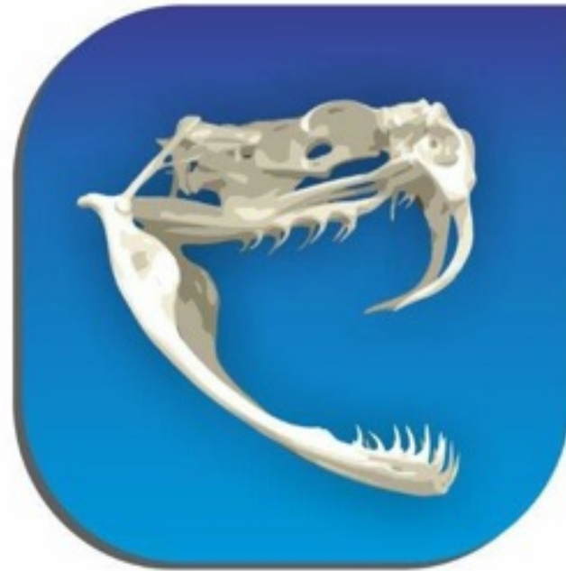
Lowveld Venom Suppliers